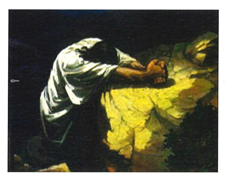
Jesus Prays on the Mount of Olives Luke 22:39-46