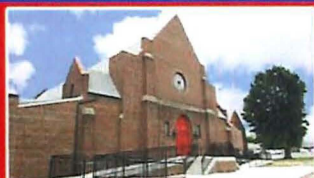
First Baptist Church 700 Highland Ave Winston-Salem, NC 27101 Host Church